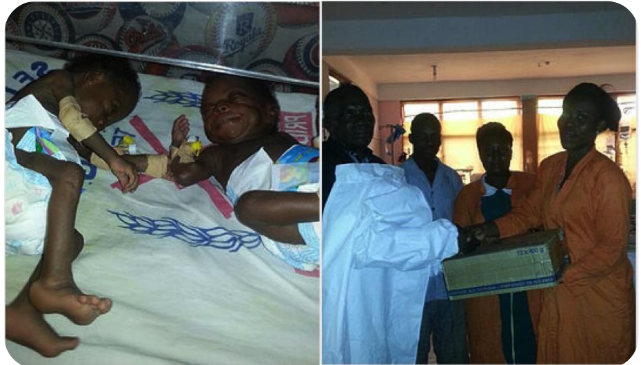
Presentation of baby food being made to the nurses at Dormaa hospital

The Department of Social Welfare approached the Orphanage. They wanted to aid newly born twin children who were born premature at the Dormaa hospital. Their mother fell into comma after delivery and had to be rushed to the nearest well-resourced intensive hospital at Komfo Anokye hospital at Kumasi. The Orphanage Leaders arranged to buy baby formula (Pre-NAN) needed to support their growing bodies. The children and the mother eventually pulled through and are now healthy and well.