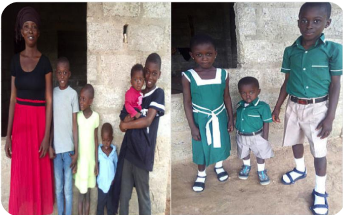
The widow and some of her children

The orphanage was contacted to help a poor widow who had eight (8) children. The woman and her children lived in an uncompleted house. Their house did not have doors or windows. Social support structures do not exist in Ghana to help such poor widows. Commonly, women in this predicament do not have a good education and, therefore, are unemployed. The widow asked for financial help to buy one bag of corn to cook and sell to make a living. The orphanage provided small seed money, enough for 4 bags of corn and items she needed to work with, so she could support her family. In addition, the orphanage provided basic school supplies (uniforms, sandals, school bags, books, etc.) for three of the widow's children and also helped to enroll them in school.